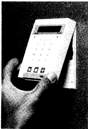
FIGURE 1 Mounting

To remove the control station insert a small screwdriver into one of the two holes at the bottom of the unit, while applying a light pulling action away from the mounting surface. After the first lock is disengaged, repeat for the second. Slide the unit upward so that the interlocking hinges detach and free the control station.